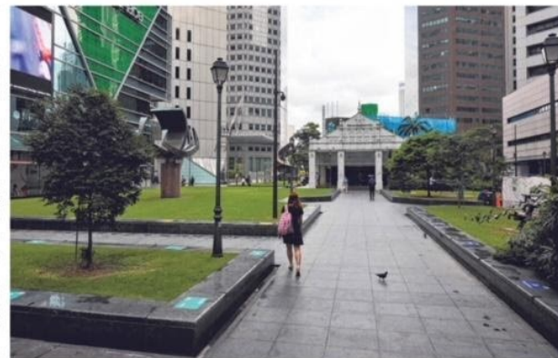
The usual office crowd was missing in Raffles Place at 8.40am yesterday, as Singapore moved to working from home as the default.